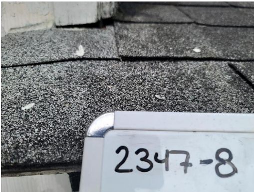
2347-8 Asphalt Shingle Typical Exterior Roof