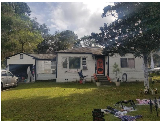
2347 NE 16 th Court Ocala, FL 34470