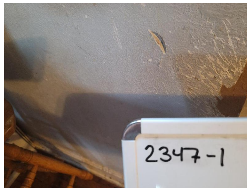
2347-1 Drywall, Joint Compound Typical Interior Walls