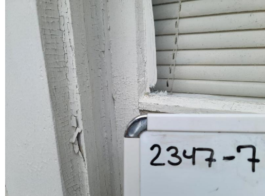
2347-7 Window Glazing (<1% Chrysotile) 5 Exterior Windows