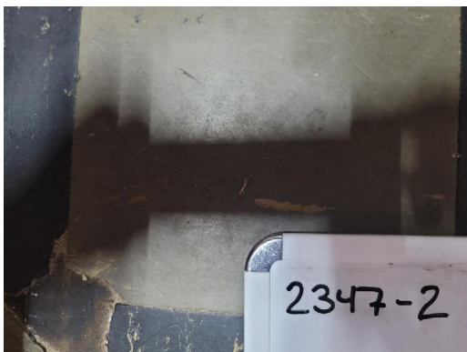
2347-2 9" x 9" Floor Tile – Tan (6% Chrysotile) Mastic (4% Chrysotile) Bedroom A (48 square feet)