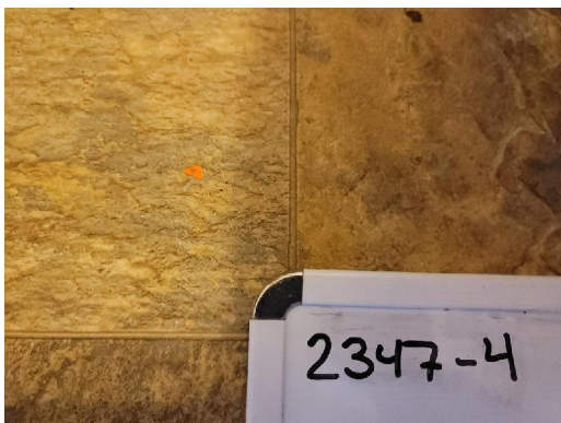
2347-4 Rolled Flooring Mastic Kitchen (78 square feet)