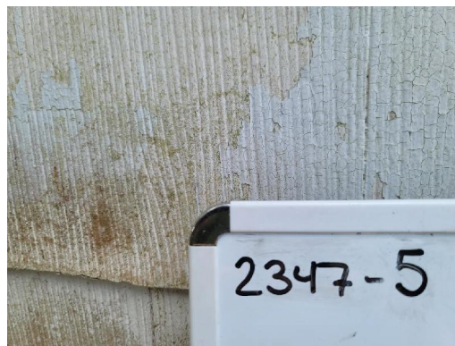
2347-5 Transite Siding (10% Chrysotile) Typical Exterior Walls