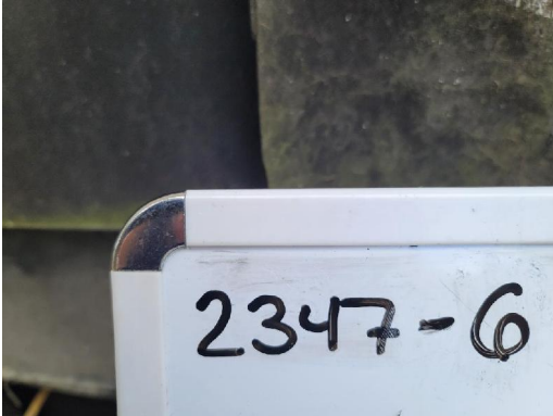
2347-6 House Wrap Typical Exterior Walls