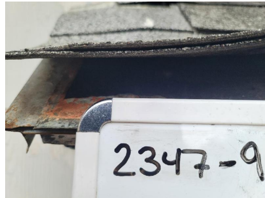
2347-9 Rolled Roofing Typical Exterior Roof