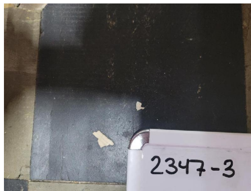
2347-3 9" x 9" Floor Tile – Black (3% Chrysotile) Mastic (3% Chrysotile) Bedroom A (48 square feet)